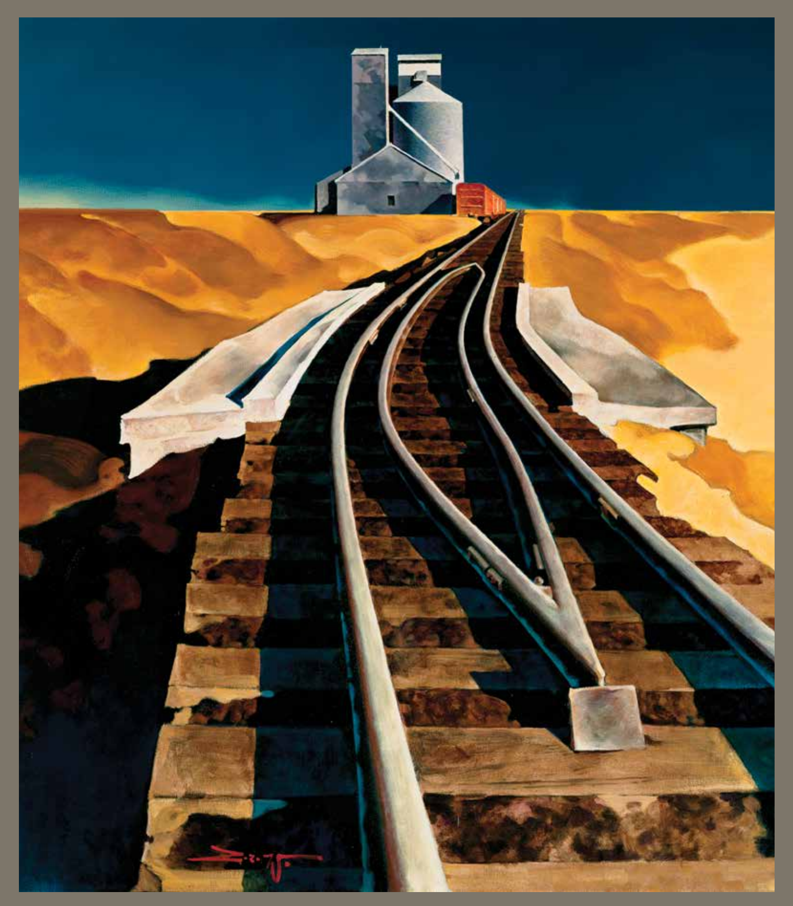
Tracks Oil on Canvas | 72 x 72 inches | 2010